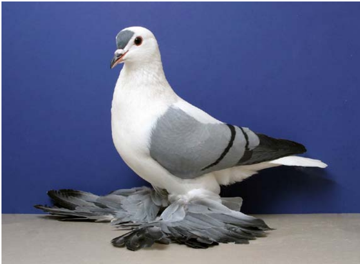
Champion Swallow, Best Young Swallow & Best Silesian YC # 224 rated E-97, by Bill Griebel