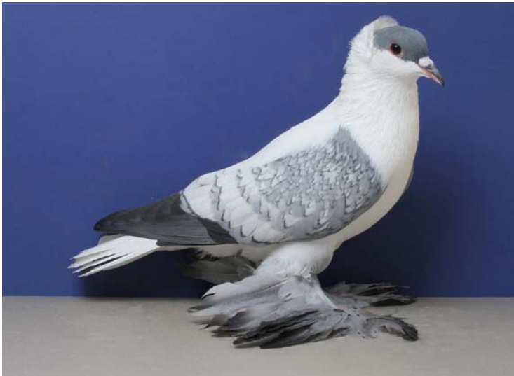
Best Saxon Swallow OH #1799 rated E-97 bred by Leon Stephens