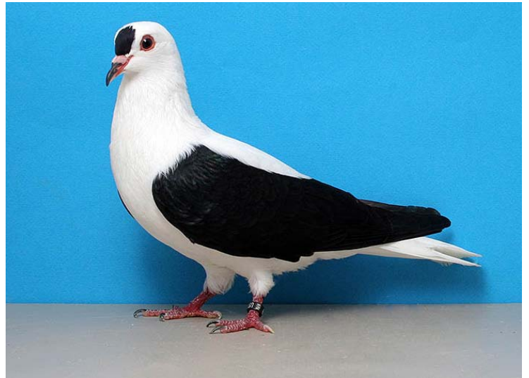
Best Thuringer Wing Pigeon OC #309 rated E-97 bred by Jay Beals